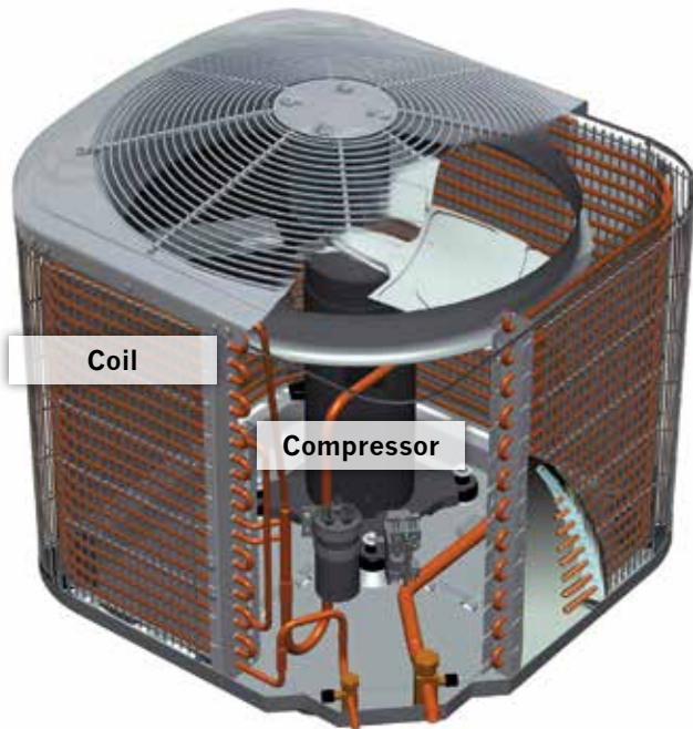
Comfort™ 16 Air Conditioner Shown

* Upon timely registration. The warranty period is five years if not registered within 90 days of installation. Wi-Fi® is a registered trademark of the Wi-Fi Alliance Corporation.